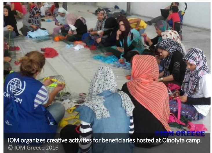
IOM organizes creative activities for beneficiaries hosted at Oinofyta camp.

On 21 September, the Alternate Citizens Protection Minister, Nikos Toskas, together with the Secretary of State for Migration, Tzanetos Fillipakos, and IOM Greece's Chief of Mission, visited the new centre in Amygdaleza that is temporarily hosting migrant families wishing to voluntarily return to their home country. The families have been registered through IOM's Assisted Voluntary Return programme. IOM supported the centre's construction by helping to provide door locks, purchasing and installing playground material, installing a child protection fence, constructing two rest areas, purchasing benches, as well as providing and installing air conditioning. The new centre is able to accommodate up to 158 people.