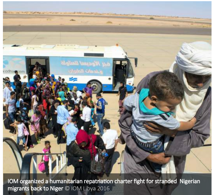
IOM organized a humanitarian repatriation charter flight for stranded Nigerian migrants back to Niger

with their onward travel to their respective communities. Twenty of the most vulnerable migrants were also provided with reintegration assistance. Funds for this charter were provided by the European Union.