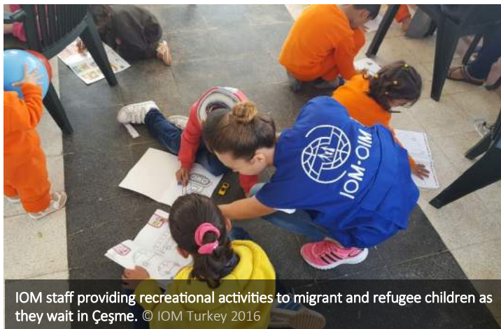
IOM staff providing recreational activities to migrant and refugee children as they wait in Çeşme.

In Çeşme (one of the points in İzmir for irregular migrants and refugees crossing to Chios, Greece), the IOM field team provided food, water and NFIs to 308 rescued migrants and refugees, the majority of whom were also from Syria. Furthermore, in Küçükkuşu (a point in Çanakkale province where irregular migrants and refugees cross to Mytilene, Greece), IOM distributed food, water, and NFIs to 194 rescued migrants and refugees, the majority of whom are Syrian or Afghan.