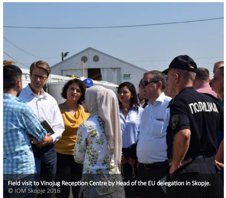
Field visit to Vinojug Reception Centre by Head of the EU delegation in Skopje.

IOM also helps to support the Border Police units in facilitating communication with migrants/refugees by establishing mobile teams of interpreters from Arabic to Macedonian.